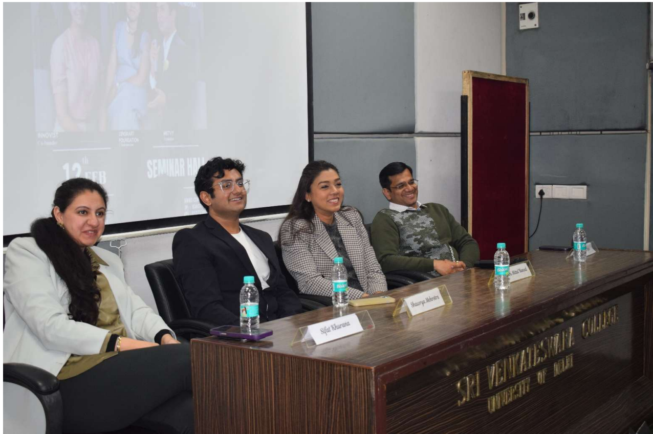
Panelists engaging in discussion