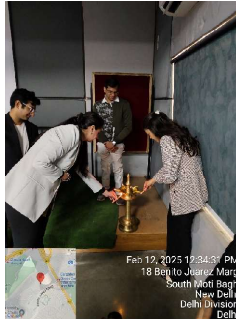
Panelists inaugurating Momentum with the traditional lamp lighting ceremony.