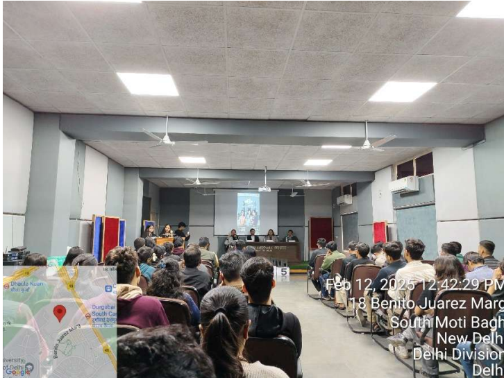
Audience immersed in the insightful panel discussion