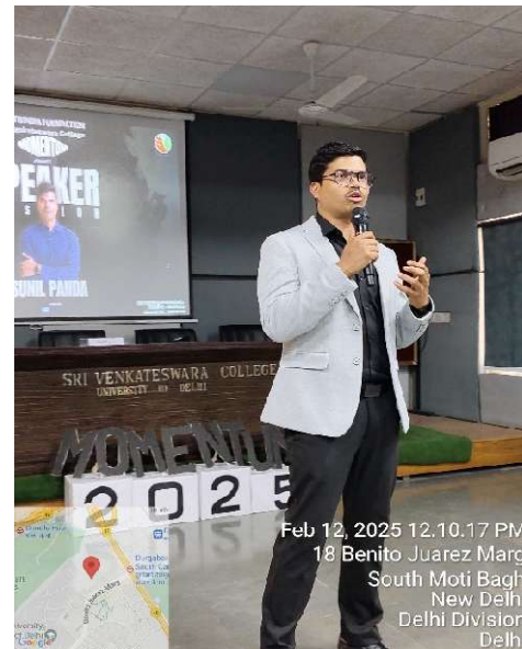
Esteemed Speaker engaging the audience with valuable insights on at Momentum